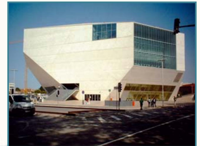
Casa Da Música